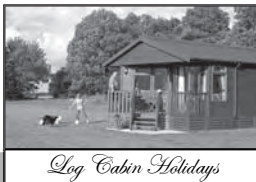
Log Cabin Holidays