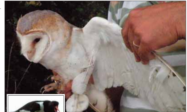
The barn owl and an angry oystercatcher.

WE ALL KNOW OF THE IMPRESSIVE migrations of many birds such as the swallow, but I was surprised by the travelling efforts of the humble blackbird , our most common thrush. One was ringed in Bungay in January by Steve Piotrowski. It was recovered , which is a birding-word