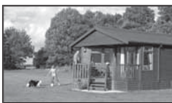
Log Cabin Holidays