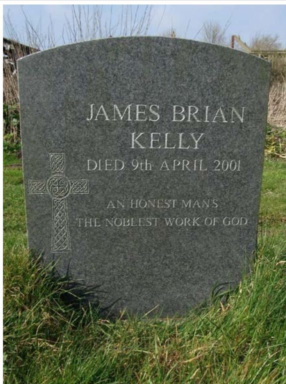
Headstone Number: 6

What we keep in memory Is ours unchanged forever