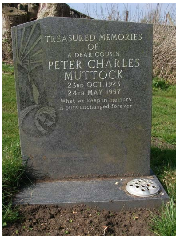
Headstone Number: 5

TREASURED MEMORIES OF A DEAR COUSIN PETER CHARLES MUTTOCK